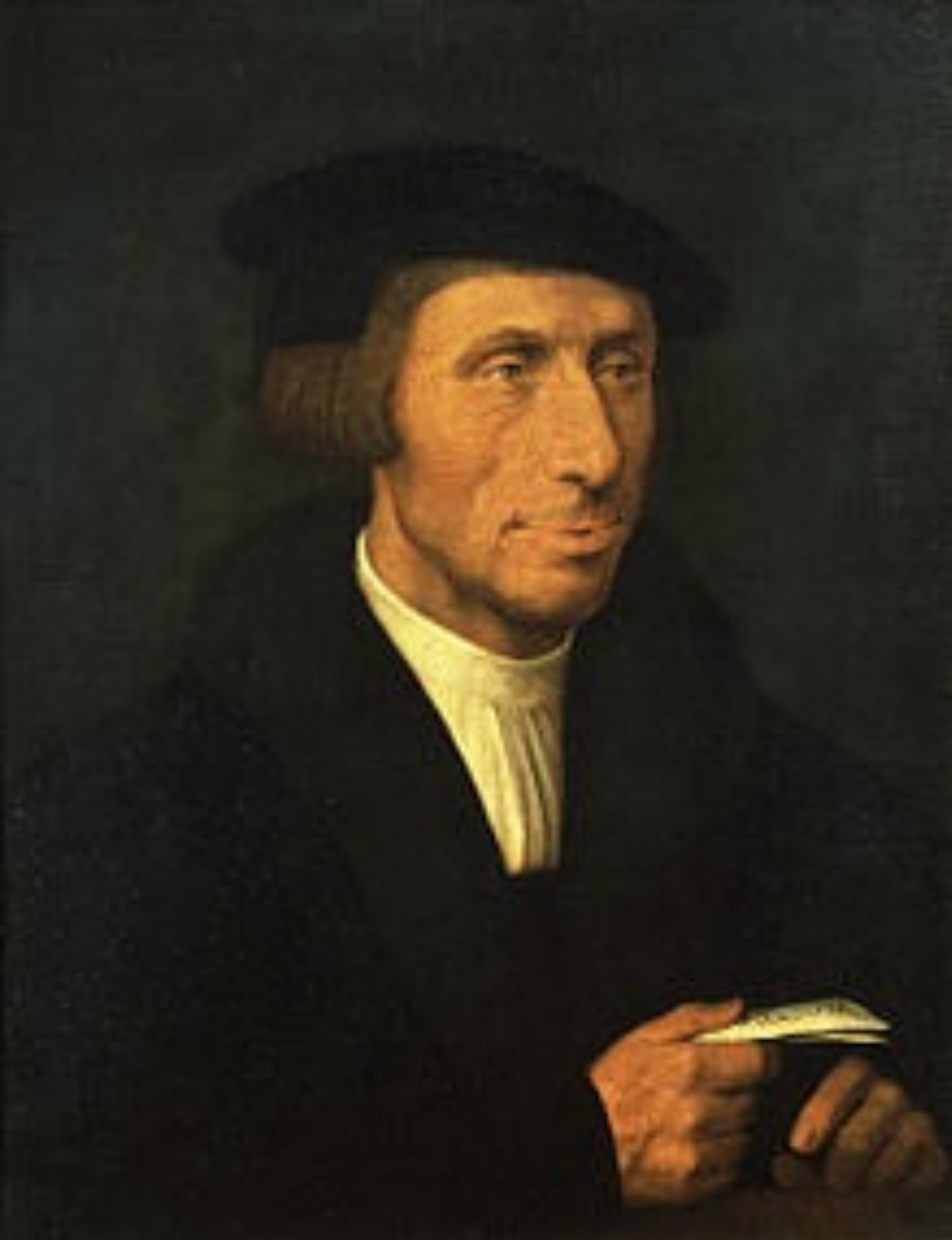
THOMAS LINACRE 1460 – 1524