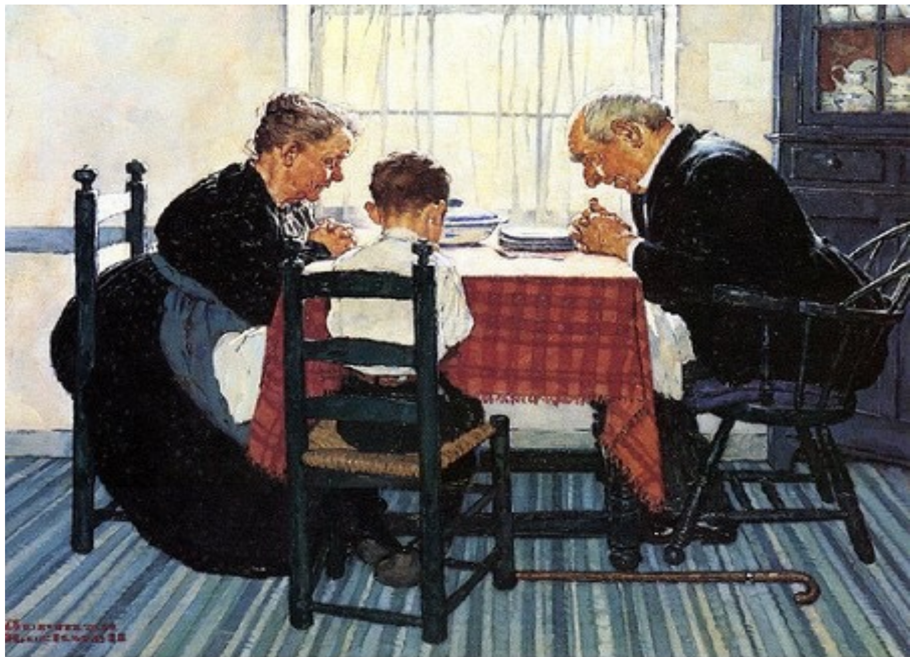
Rockwell "Family Grace" 1938